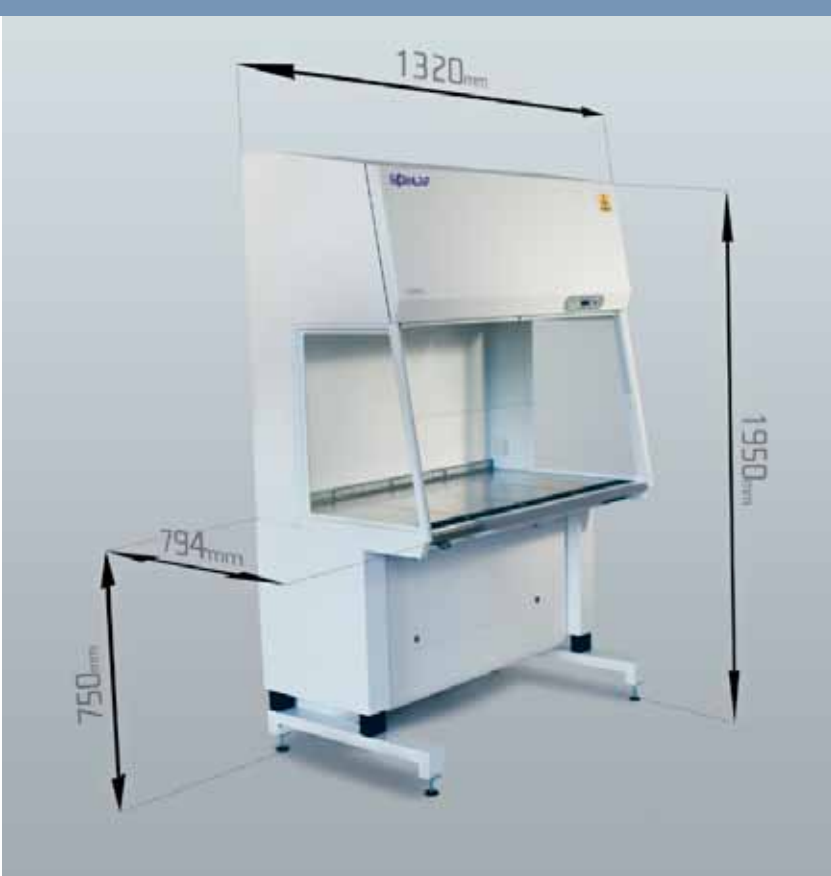
Class 2 Airflow diagram showing true turbulent-free laminar air-flow that provides operator, product and environmental protection, with lowest noise level available today.