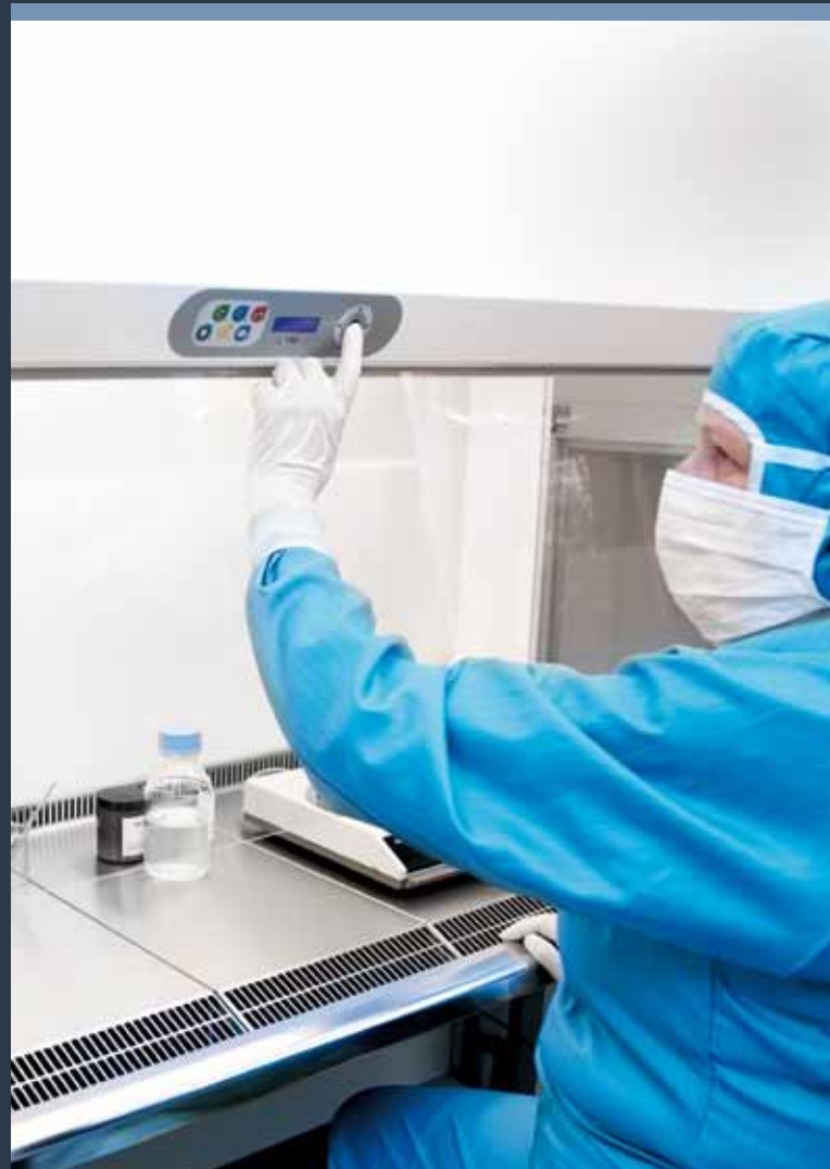
The cabinet can easily be adjusted from the service mode by authorized personnel. Down flow speeds can be adjusted from 0.10 m/s up to 0.55 m/s.