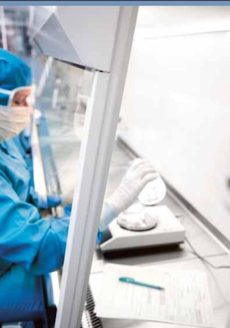
Diffused laminator technology allows shadow free light distribution throughout the chamber with light adjustment of 0-2000 Lux. illumination.